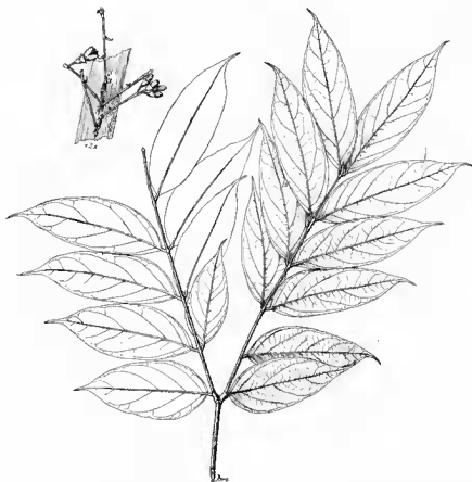
Pl. 6. — Affonsea pteropoda Kosterm. : D'Albertis ss. n° (Firenze 3544) et 3545, leaf right.

up to 27 cm long; wing membranous, reticulate, up to 1 cm wide, gradually widening from the base upwards, at the insertion of the folioles constricted again and then absent. Folioles subopposite, three pairs, papery, lanceolate to ovate-lanceolate, base asymmetric, contracted into a hardly visible, thick petiole, apex sub-caudately acuminate, 4-7 × 10-25 cm, both surfaces prominently reticulate, midrib slightly prominent on upper, strongly prominent on lower surface; lateral nerves 8-11 pairs, arcuate, prominent on lower surface.